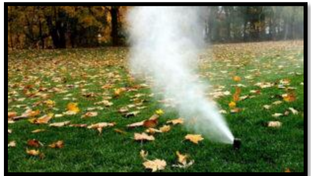
The above photo is a sprinkler system being blown out. https://sabhomes.com/winterizing-sprinkler-system/

(For more information go to https://www.rainbird.com/homeowners/how-do-i-winterize-my-irrigation-system and https://www.hunterindustries.com/winterizing-your-irrigation-system )